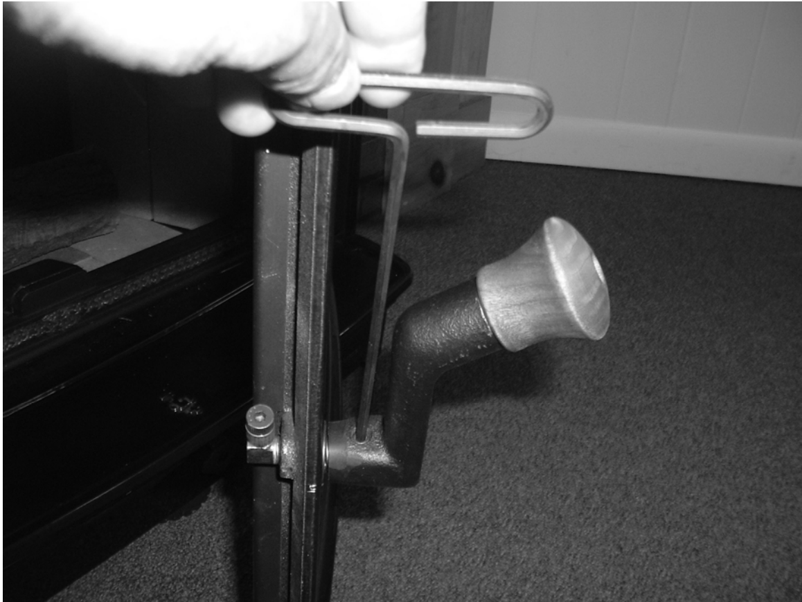
Photo 2: Use the allen wrench to remove the setscrew that locks the cast iron crank to the latch shaft.

Note: To adjust the latch, loosen the set screw and turn the cast crank in or out to make the initial adjustment. If more adjustment is needed, separate the crank and latch and add a shim washer to loosen the assembly or subtract a washer to tighten it. Assemble the pieces as described in step 6.