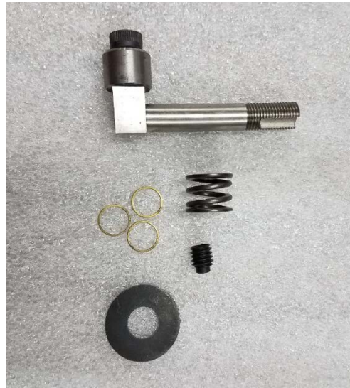
Figure 1: Latch Components

BEFORE YOU BEGIN: Always work on a cool stove. Read the instructions thoroughly before starting the repair. Identify all parts included in the kit. Report any shortages to your dealer.