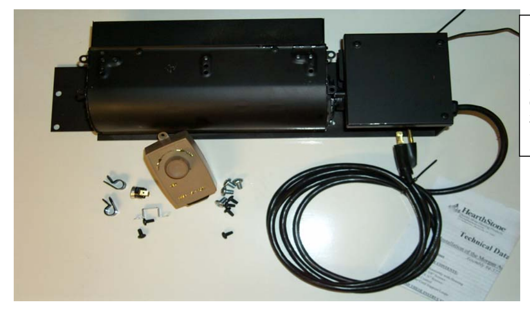
Photo #1 Blower Components: Fan & Housing, Speed Control, Snap Switch & Bracket, Cord Loops (2), 10-24 Screws (6), and ¼" Screws (4)

ELECTRICAL GROUNDING INSTRUCTIONS: This blower is equipped with a three-pronged (grounding) plug for your protection against shock hazard and should only be plugged into a properly grounded three-prong receptacle. Do not cut or remove the grounding prong from the plug.