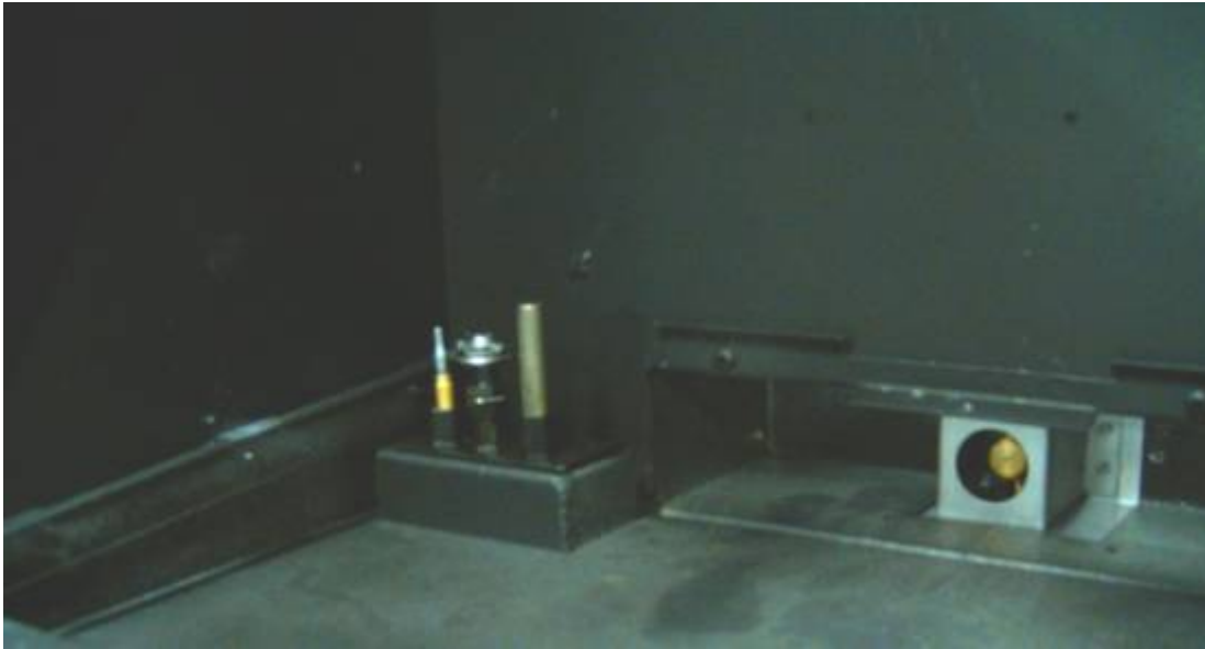
Photo shows Pilot assembly (left) and air shutter with burner orifice (right) in the firebox after the pan burner has been removed.