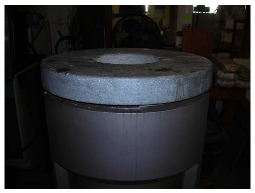
Figure 4: Top Stone Ring

8. Carefully lift the Top Stone Ring into place. Ensure you place the split in the ring toward the back of the stove. Also ensure there is at least a ½" gap between the bottom of the stone and the top of the front door. If there is insufficient gap, remove the stone and loosen the screws under the ring to raise it.