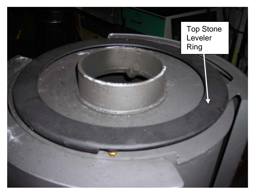
Figure 3: Top Stone Leveler Ring

7. Using the hex wrench, tighten, or loosen, the screws under the ring so that the ring is level and there is no rattle.