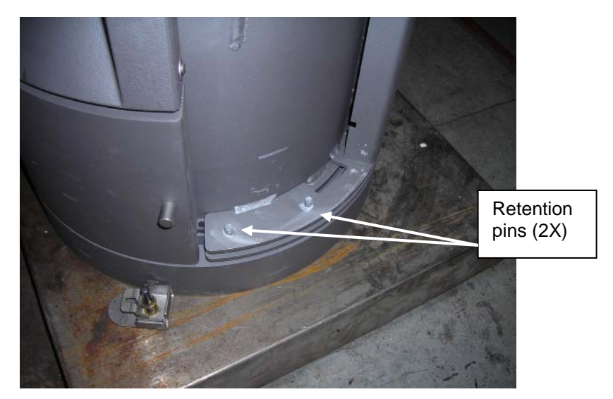
Figure 1: Bottom stone retention pins

4. Slide the bottom of the right stone over the Bottom Retention Pins . The holes in the stone should slide over the pins until the bottom of the stone rests on the base of the stove.