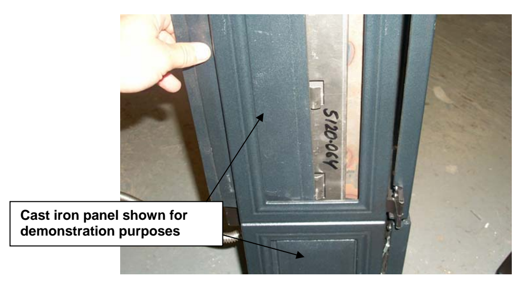
Figure 4. Side Panel Installation