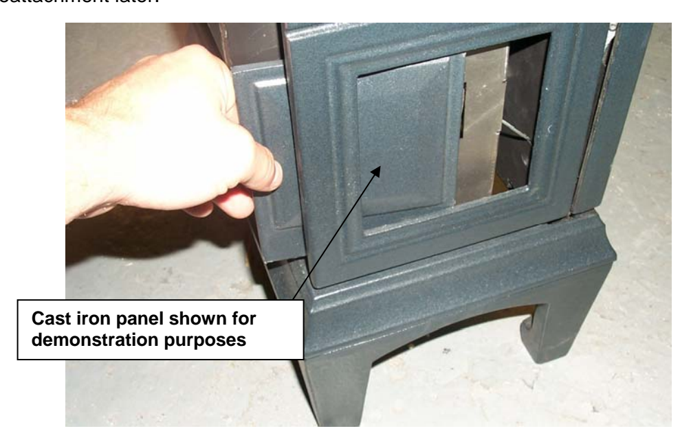
Figure 3 Small Panel Installation