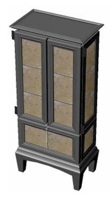
Figure 1 Tudor with Custom Installation Kit (Tiles Not Included)