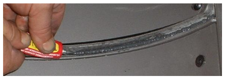
Figure 3: Apply Gasket Adhesive

<u>uniformly</u> without stretching or compressing the gasket material. Pinch the gasket into place as necessary. Use masking tape to hold the rope in the channel along the top and bottom of the door.