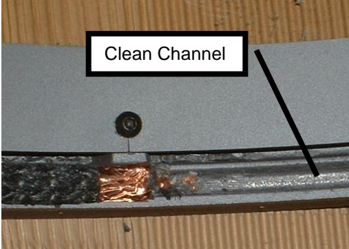
Figure 1: Dirty vs. Clean Channel

2. Vacuum the inside of the door as required. Loosely re-attach the door's side plates.