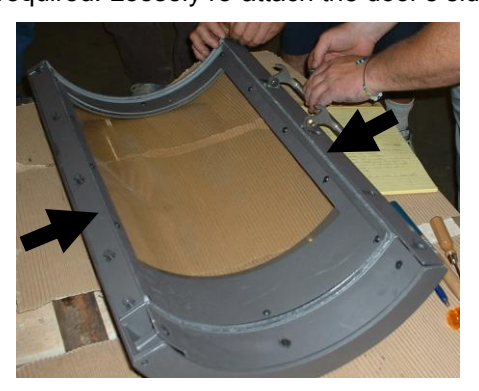
Figure 2: Loosely Attach Side Plates

2. Vacuum the inside of the door as required. Loosely re-attach the door's side plates.