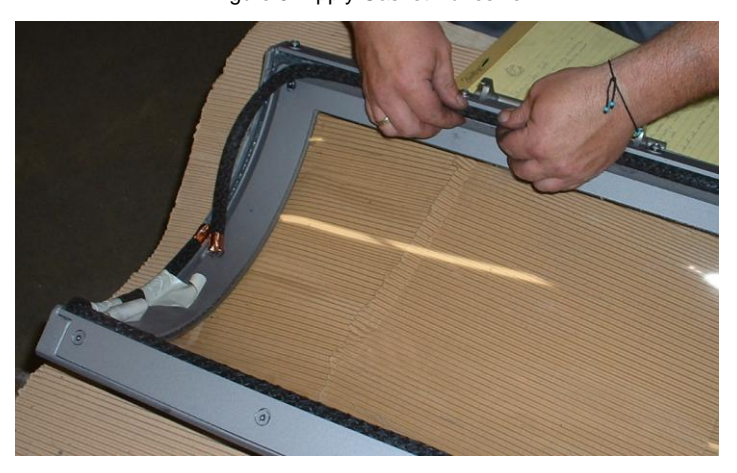
Figure 4: Install Gasket