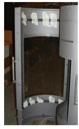
Figure 5: Installed Door Gasket