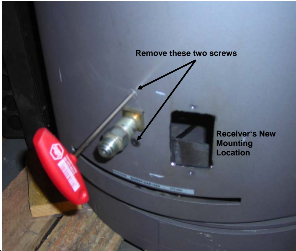
Figure 3 – Gas Connector Mounting Detail