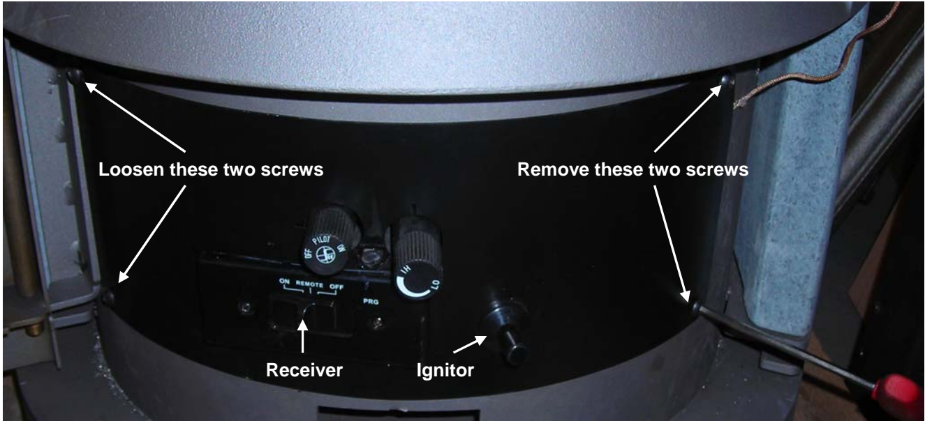
Figure 1 – Modesty Panel Detail