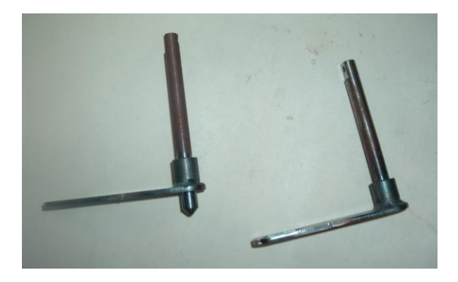
Photo # 1 Left: Original Primary Air Linkage Right: New Primary Air Linkage (provided in this kit)

The primary air linkage moves through two holes in the bottom of the stove. As the cast parts expand and contract in response to the heating and cooling of the firebox, the rod may shift very minutely, but enough to cause it to bind on rare occasions. This may cause the air control to move with difficulty, or become stuck. To completely eliminate this as a concern, the linkage rod (shown in photo #1) has been modified. The exposed portion of the shaft above the connector arm on the top of the linkage has been eliminated. The linkage now passes through a single hole and will not bind, but still has enough support to stay in place and function properly.