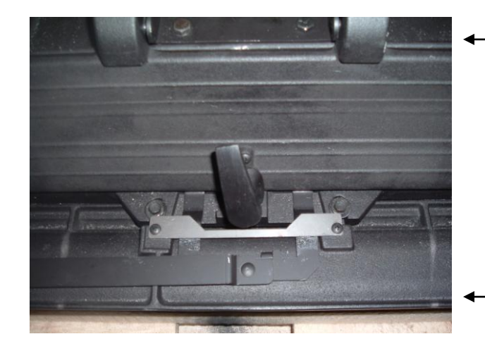
Photo #2: Ash Dump (viewed upside down) Bolts to remove the ash door (located between the hinge tabs)

Screws to remove retaining bracket (located to the left and right of the ash latch)