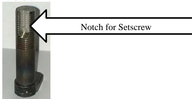
Figure 2: Latch shaft showing detail of groove of the edge where the set screw will lock into place.