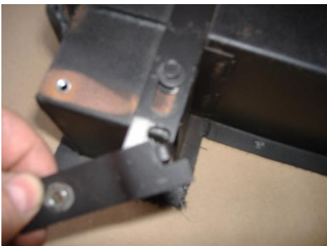
Photo #2 Place the tab of the lever into the slot on the air control slide.