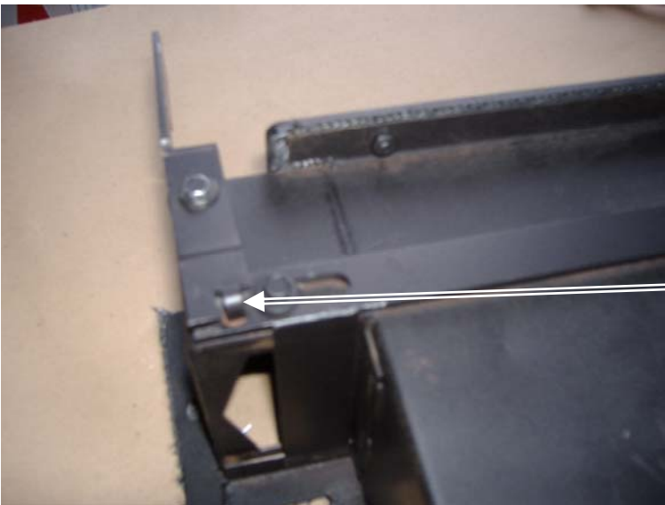
Photo #4 The air control lever installed. Note the tab in the slot.