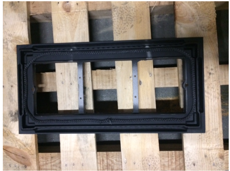
Top Casting rope gasket detail