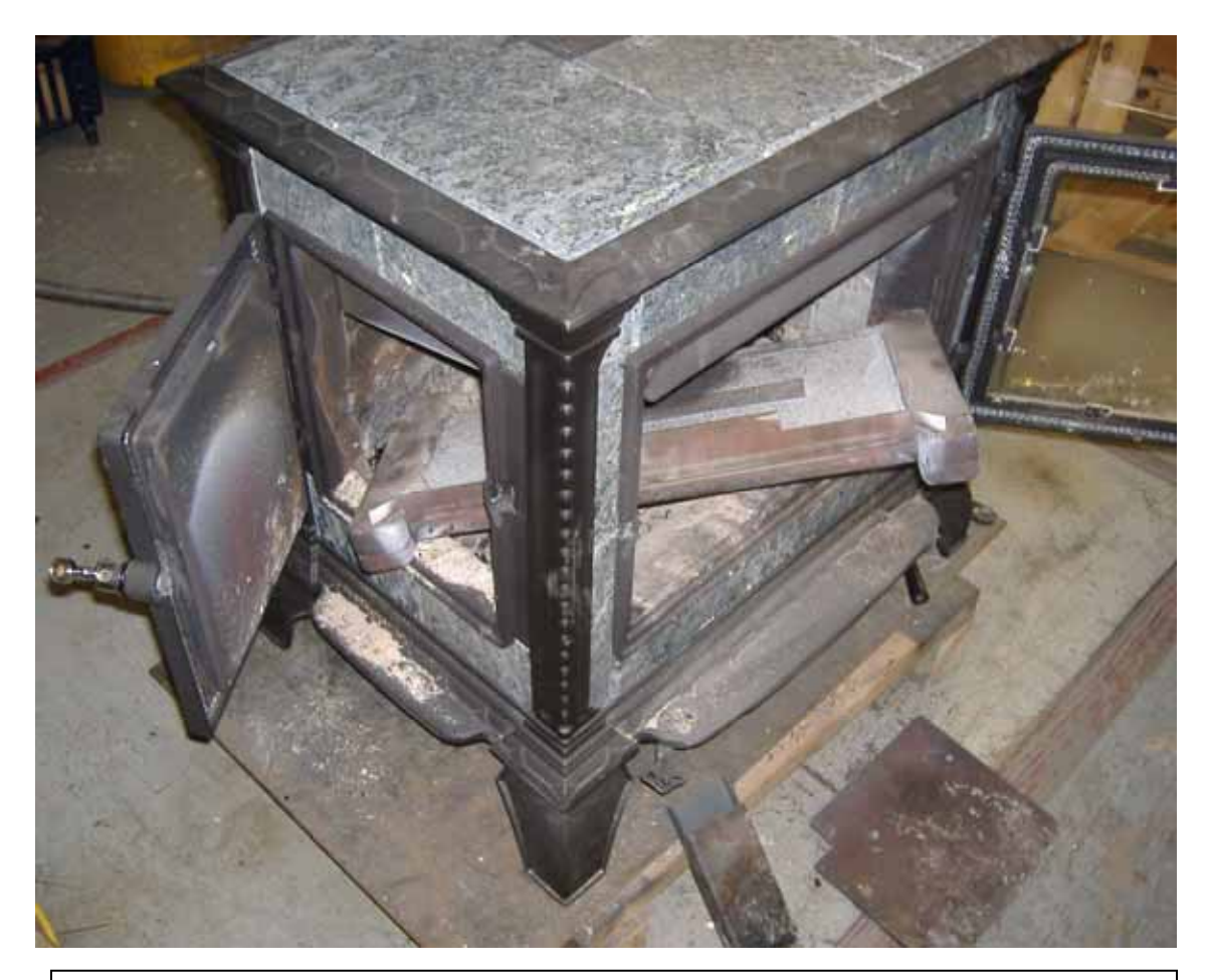
Photo #1: The secondary air manifold shown angled for removal through the front door. The side plate and riser are removed to increase the room in the firebox to make this possible.